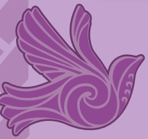
GOSPEL ILLUSTRATIONS HE WHAKAAHUA O TE RONGOPAI

ALL RESOURCES FOR LENT 2021 ARE AVAILABLE AT WWW.CARITAS.ORG.NZ