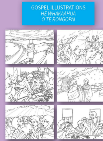
GOSPEL ILLUSTRATIONS HE WHAKAAHUA O TE RONGOPAI

ALL RESOURCES FOR LENT 2021 ARE AVAILABLE AT WWW.CARITAS.ORG.NZ