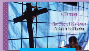
THE WAY OF THE CROSS POWERPOINT TE ARA O TE RIPEKA