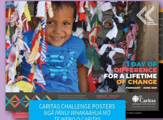
CARITAS CHALLENGE POSTERS NGĀ PĀNUJ WHAKAAHUA MŌ TE WERO O CARITAS