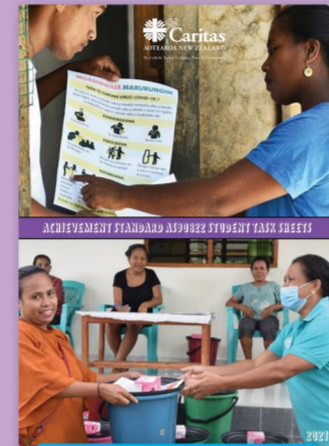
ACHIEVEMENT STANDARD PAEREWA PAETAE