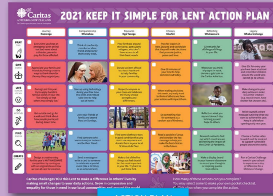
ACTION PLAN MAHERE KŌKIRI