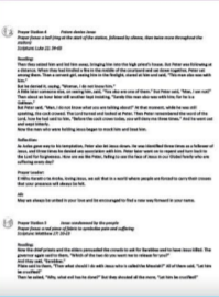
THE WAY OF THE CROSS NOTES HE TUHINGA MŌ TE ARA O TE RIPEKA