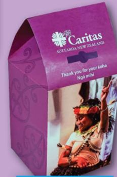
KOHA BOXES NGĀ POUAKA KOHA