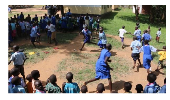
Children at St Theresa's Primary School in Torit play the game Are You Ready?

Changing the size of the circle and the out of bounds areas will change the level of difficulty for the tagger. A more extreme game would see multiple taggers with the additional rule that when players are tagged they become 'frozen'. When another free player touches them they can be saved and run once more.