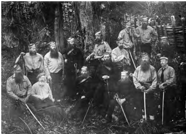
NZ Armed Constabulary at Parihaka.

Following Te Whiti's refusal to submit to government forces, more than 1500 men led by Minister of Native Affairs John Bryce and the former Minister, William Rolleston, marched into Parihaka. They were met by a group of children playing games and singing at the entrance. They were then presented with bread baked by the women. Despite receiving a peaceful reception, Bryce and his volunteers arrested the men of Parihaka including Tohu and Te Whiti. The women and children who remained experienced a terrifying period of looting, ransacking and rape. The large contingent of soldiers remained at Parihaka until 28 November and a fort was built on a hill within Parihaka to enforce Government policy. The fort remained in place for several years.