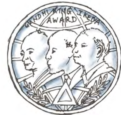
The peace medal gifted to Parihaka in 2003 by representatives of Martin Luther King Jnr, Gandhi and Daisaku Ikeda.

Today at Parihaka there is a small community living around three marae. The meetings on the 18th and 19th of the month continue, as locals