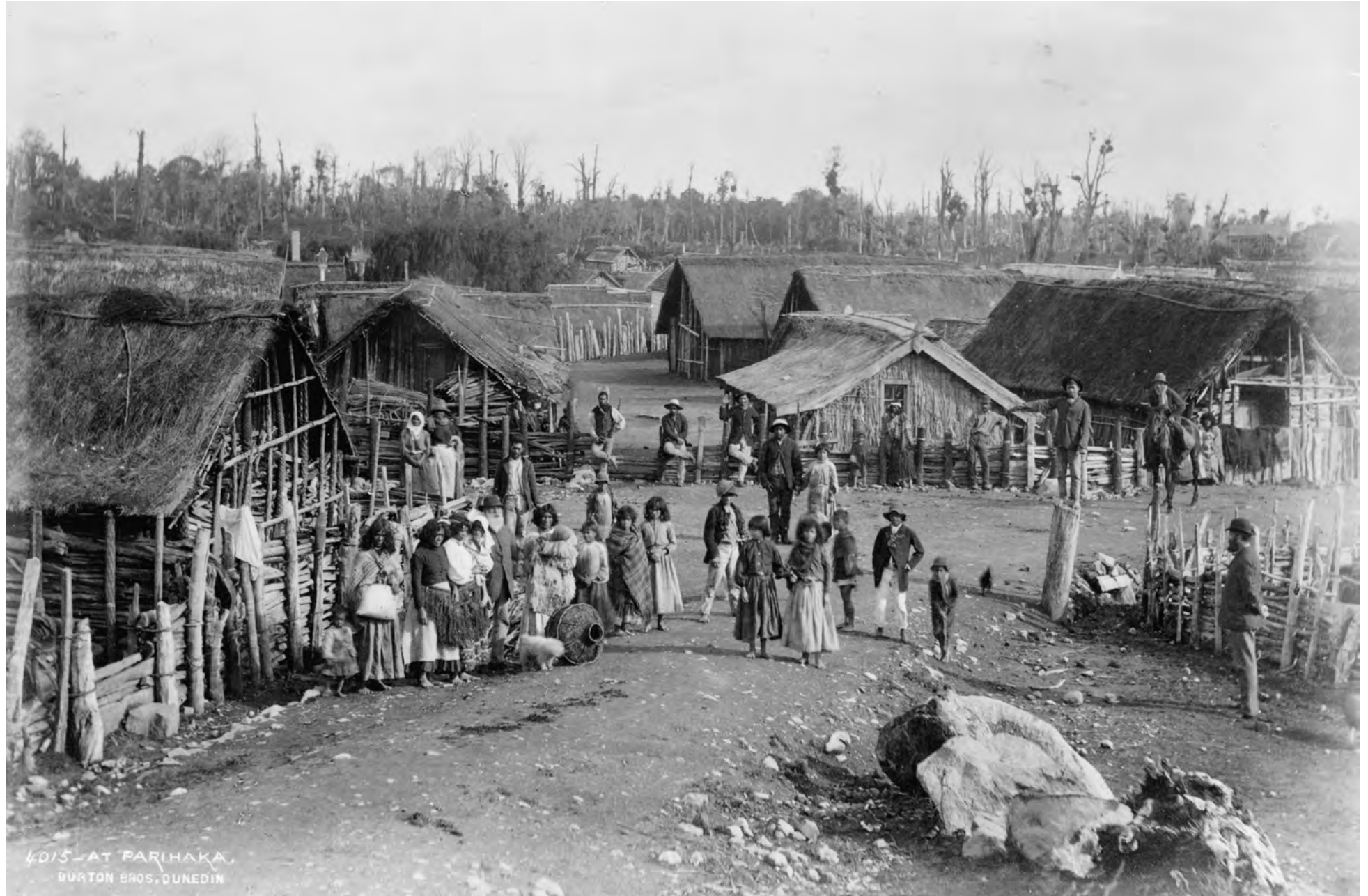
4015-AT PARHAKA. BURTON BROS., DUNEDIN