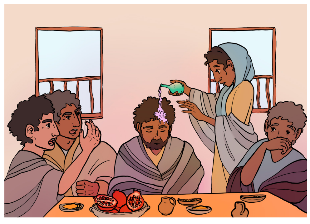
The Anointing at Bethany