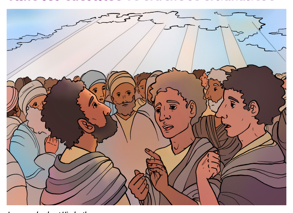
Jesus speaks about His death