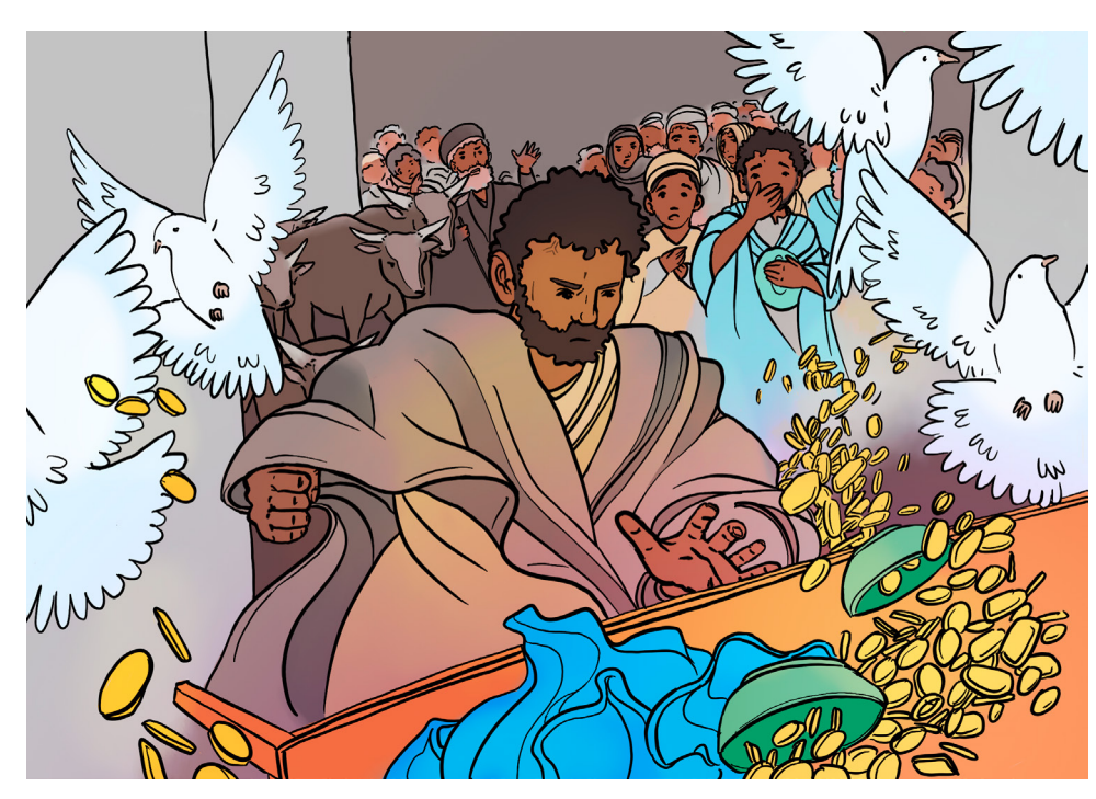
Jesus cleanses the temple