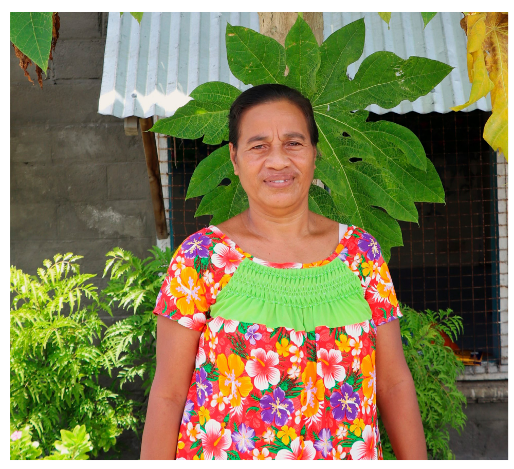
Tebora, Kiribati.

Teitoiningaina works with schools, church groups, and various community groups. Through our partnership, we are privileged to support Teitoiningaina's transformative work to enrich the lives of people in Kiribati.